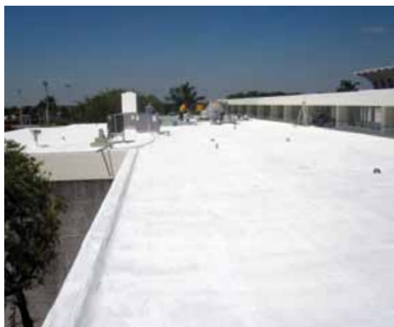
Completed PremiumCoat® System

HydroStop is a world leader in the manufacture of environmentally-safe roofing and waterproofing systems. Our products are formulated to provide permanent, sustainable solutions to water ingress problems throughout the entire building envelope. HydroStop’s high quality products have been used worldwide and carry various approvals from FM (Factory Mutual), UL (Underwriters Laboratories), CRRC (Cool Roof Rating Council), Miami-Dade (NOA 11-0531.07), FL Building Code, ENERGY STAR®, and are compliant with OTC, USGBC’s LEED program, and California Title 24.