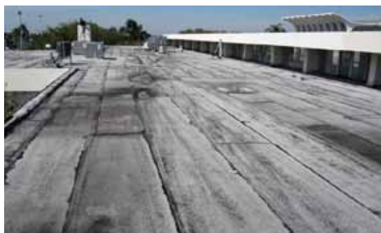
Existing mod bit roof

This roofing challenge was completed within 20 days since utilizing the PremiumCoat® System did not require the removal of the existing 20,000 sq ft modified bitumen roof. A year later, St. Brendan High School reported an 8% monthly reduction on their energy bill and expects to pay off the cost of the roof within 5 years based on energy savings.